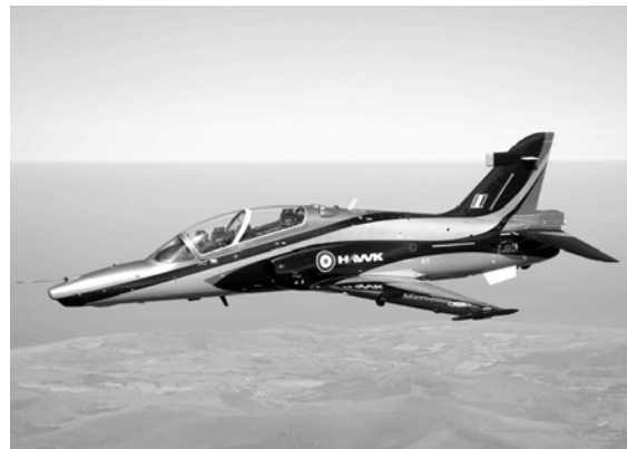
Figure 1 Hawk fast jet trainer

identify optimization opportunities that would reduce the worst-case execution time of the system by at least 10%; thus avoiding the need for an expensive hardware upgrade.