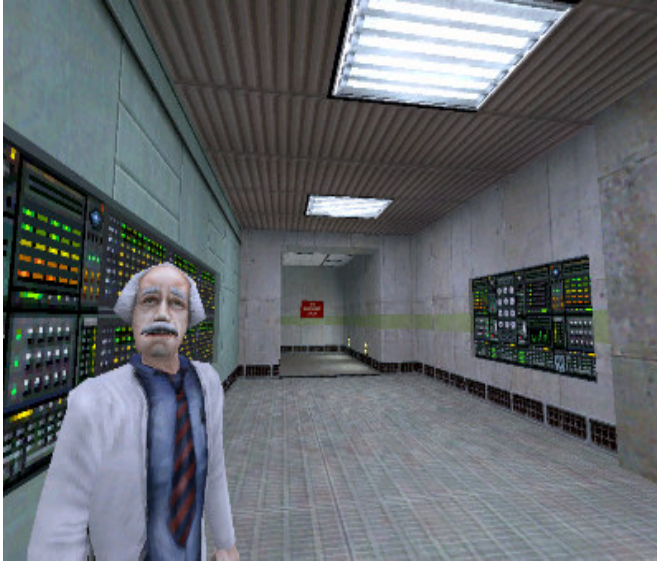
FIGURE 2. Sample of the computer interface in the first immersive task, HALF_LIFE™ . In this opening sequence, it is the participant's task to make their way around a research building to find their hazard suit.

Procedure. Each participant will complete two pen-and-paper questionnaires: the Multi-dimensional Personality Questionnaire (indicating whether they have high / low absorption) and the the NEO Five-Factor Inventory (indicating whether they have high / low openness to experience).